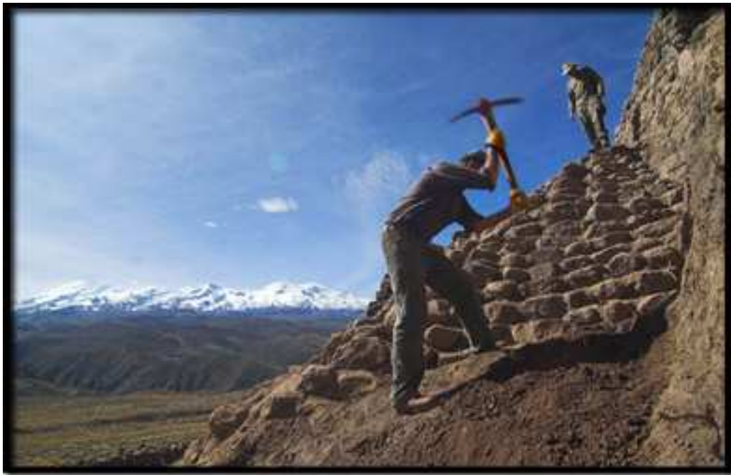
Maucallacta

At the base of the platform, the archaeologists found two dump sites with ashes and animal bones, pieces of ceramics and items made of metal and ivory, which were sacrificed to the God of Coropuna Volcano by burning on pyres.