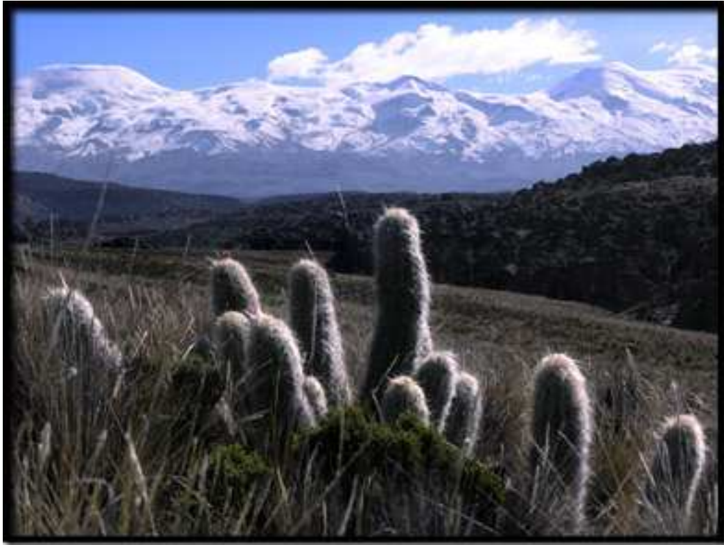
Coropuna

It was known from the colonial chronicles, that the Coropuna played an important role here.