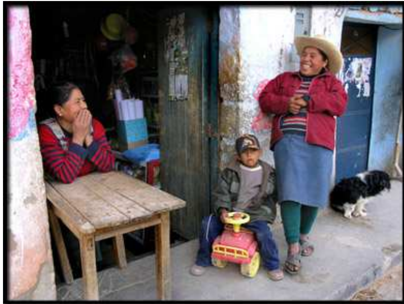
Chatting with women in Salamanca

May this inauguration of the “the tourist traffic” help convince local highlanders to protect the ruins and to invest in tourist infrastructure. The first hostel in Pampacolca was built for the archaeologists so that they could have a base camp.