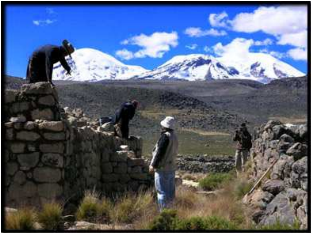
Conservation Project protects Acchaymarca - the Inca site on the west side of Coropuna