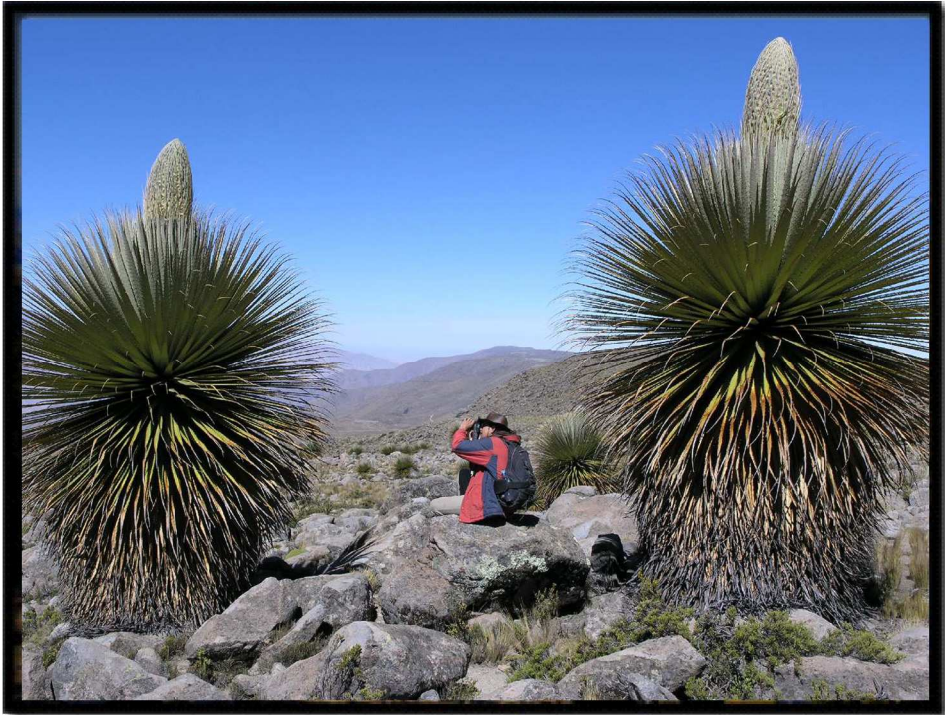
Puya Raimondi