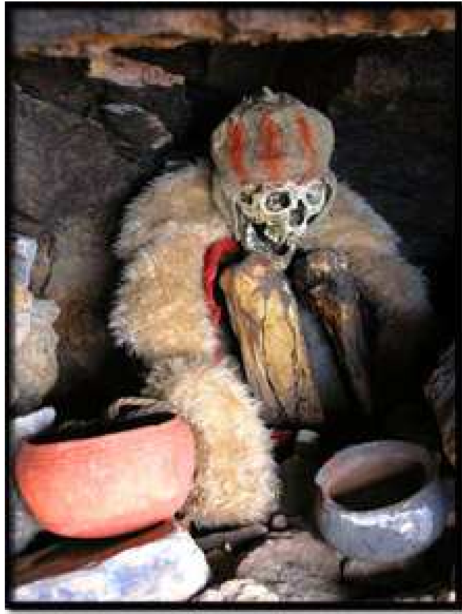
Mummy

Eight hours by car from Maucallacta by the unpaved road and then through wilderness, from the west side of Coropuna, lies Pumahuilca, a mountain with flat summit surrounded by small lakes. After an hour of hiking a herdsman led us to the last worshipped mummy in this part of Peru.