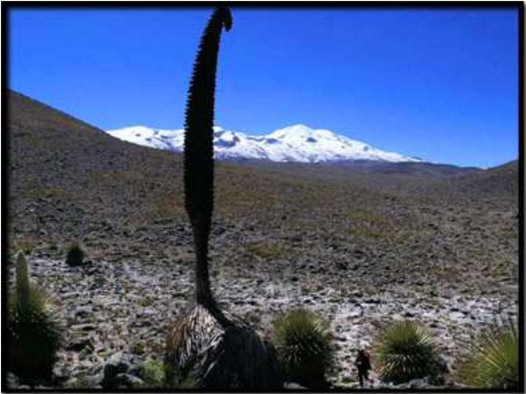
Puya Raymondi shedding blossoms on the slopes of the Coropuna Volcano

Puyas Raymondi, very rare, gigantic plants, grow at 4000-4200 m. They blossom once per hundred years resembling a 12 m column littered with 20 thousands flowers and then die. There is no mention of this place in the travel guides as well as of unused hot springs in the vicinity of Maucallacta.