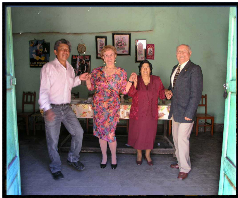
Hospitable local people in Pampacolca