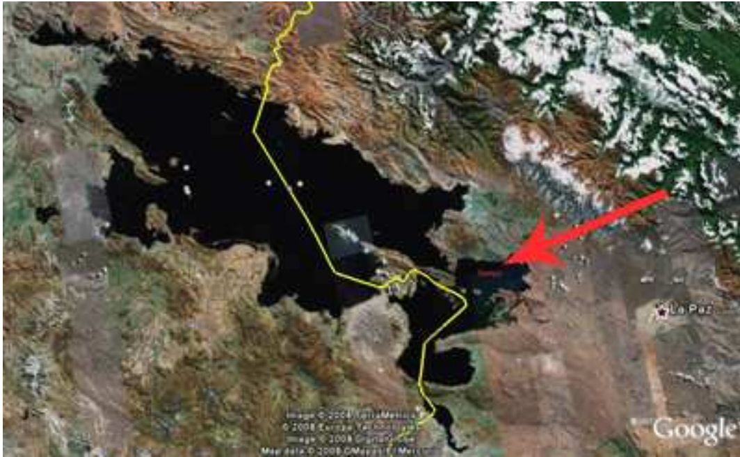
Lake Titicaca and Suriqui Island

800 km from Maucallacta begins Lake Titicaca. On the Suriqui Island there is Inca Uta – a sanctuary devoted to the cult of the Sun. So far it has been known from a brief, unpublished research carried out by Bolivian archaeologists in 1982. The researchers, however, did not examine the most interesting aspect of the site, which is the direct vicinity of the sacred rock and the ceremonial square in front of it. A small recess is hewn out in the rock: most likely a place for an idol. The recess is turned to the East so that it is illuminated by the morning sunrays.